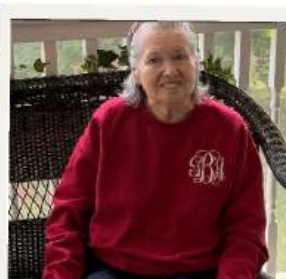
GENEVA B. 6/16