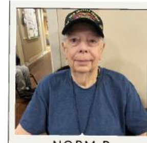
NORM P. 6/29